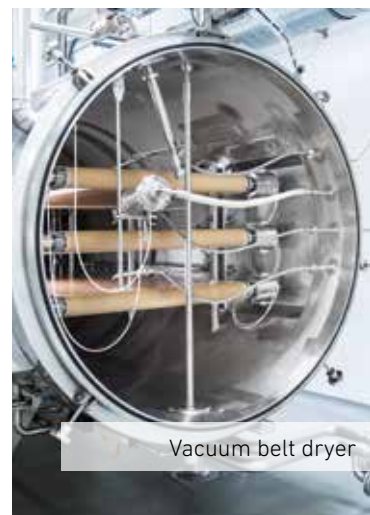
Vacuum belt dryer