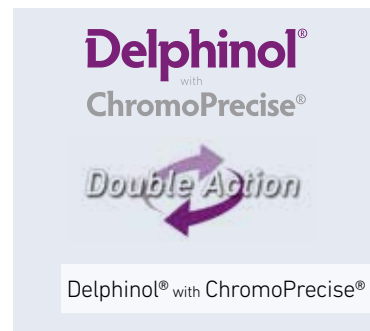
Delphinol® with ChromoPrecise®