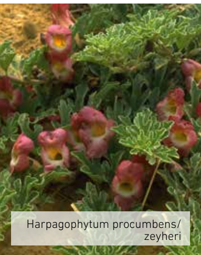
Harpagophytum procumbens/ zeyheri