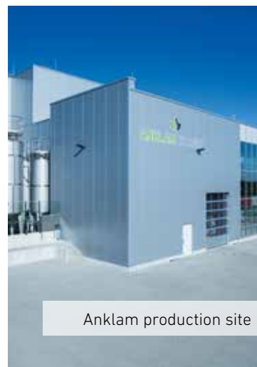
Anklam production site

We will find the right solution for your project.