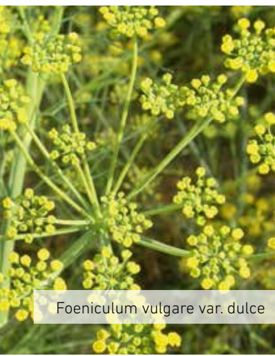
Foeniculum vulgare var. dulce