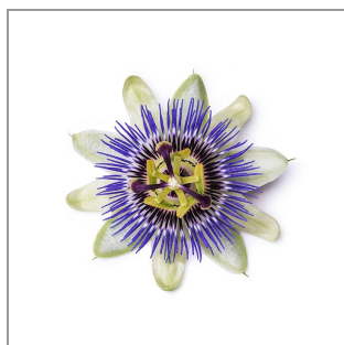
PASSIONSBLUME / PASSIONFLOWER PASSIFLORA INCARNATA