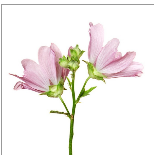
EIBISCH / MARSHMALLOW ALTHAEA OFFICINALIS