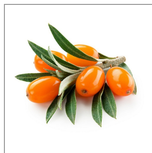
SANDDORN / SEA BUCKTHORN HIPPOPHAE RHAMNOIDES