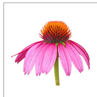
PUPURSONNENHUT / PURPLE CONEFLOWER ECHINACEA PURPUREA