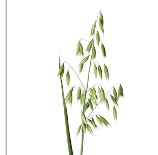
GRÜNER HAFER / GREEN OAT AVENA SATIVA