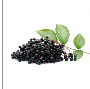
HOLUNDER / ELDER SAMBUCUS NIGRA