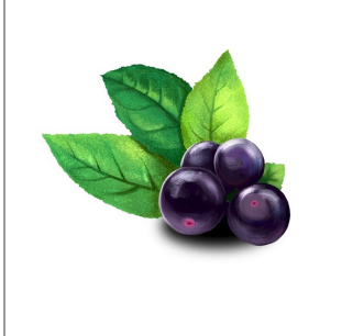
MAQUIBEERE / MAQUI BERRY ARISTOTELIA CHILENSIS